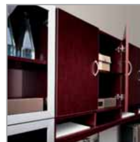
Doors can be added to hutches, cabinets, wall units and towers